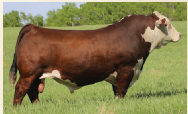
Haroldson's JVV Royal 24E - Sire