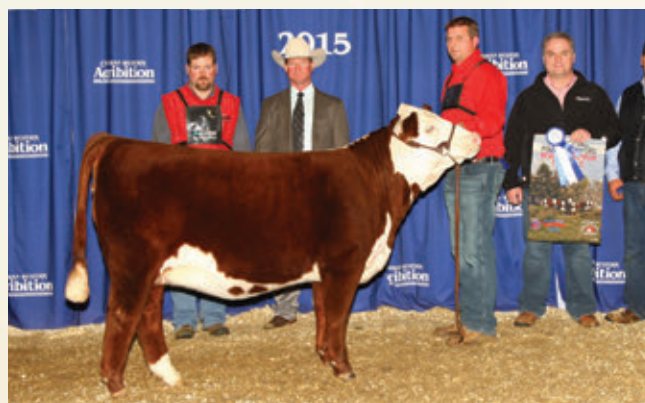
Blair's 28M 5C Tempress 3F - Dam