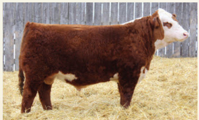
ANL 17A High Tech 216U 13C - Sire