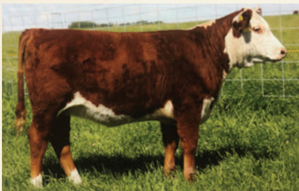
Remitall-W Catalina 67D - Dam 65J is a copy cat look alike to her Dam