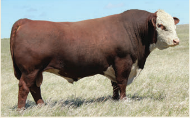
RU BA 11X Excaliber 223F - Sire