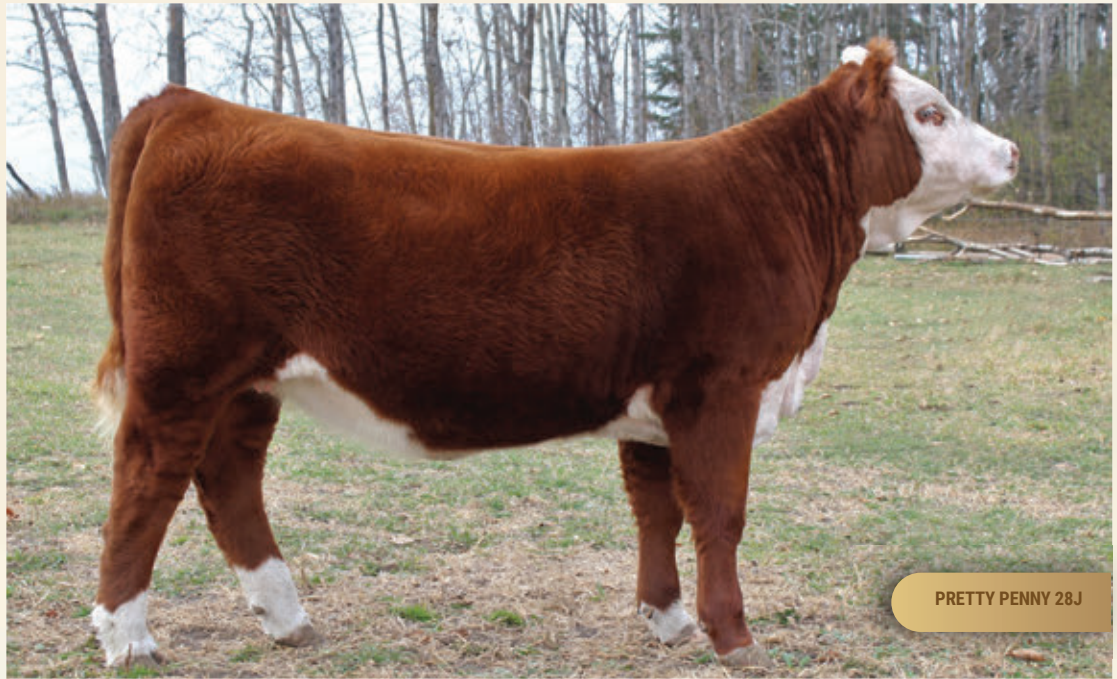
PRETTY PENNY 28J