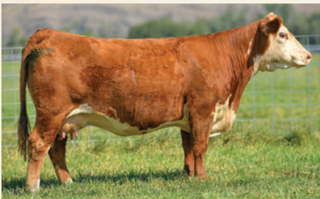
Churchill SR Lady 4204B - Dam