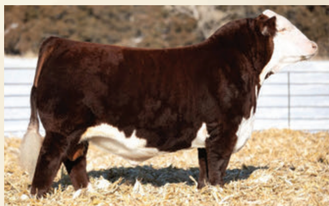
Haroldson's United 36G - Sire