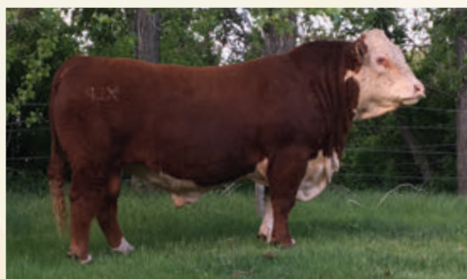
TOP BRASS 176F - SIRE