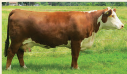
AVA 4D - DAM