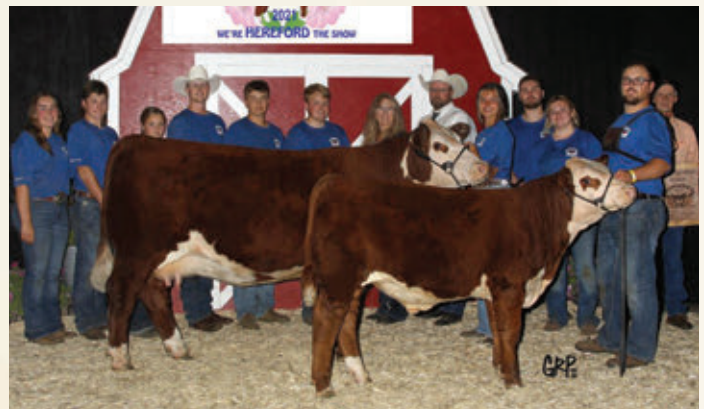
HMS HI- CLIFFE 225D GLAMOUR 32G - FULL SISTER