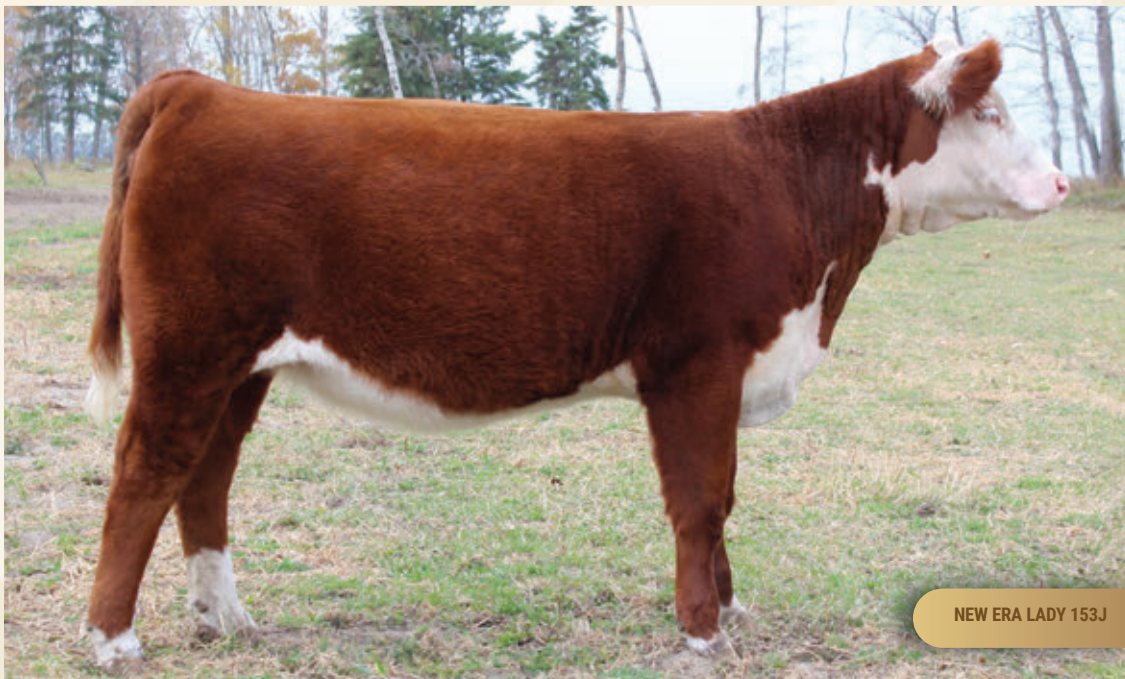
NEW ERA LADY 153J