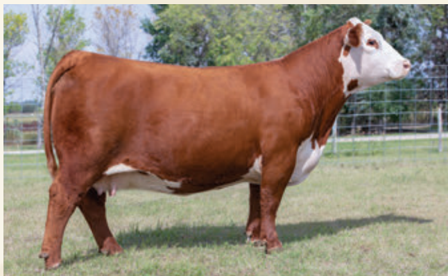
ANL 71D Jada 123C 115F - Dam